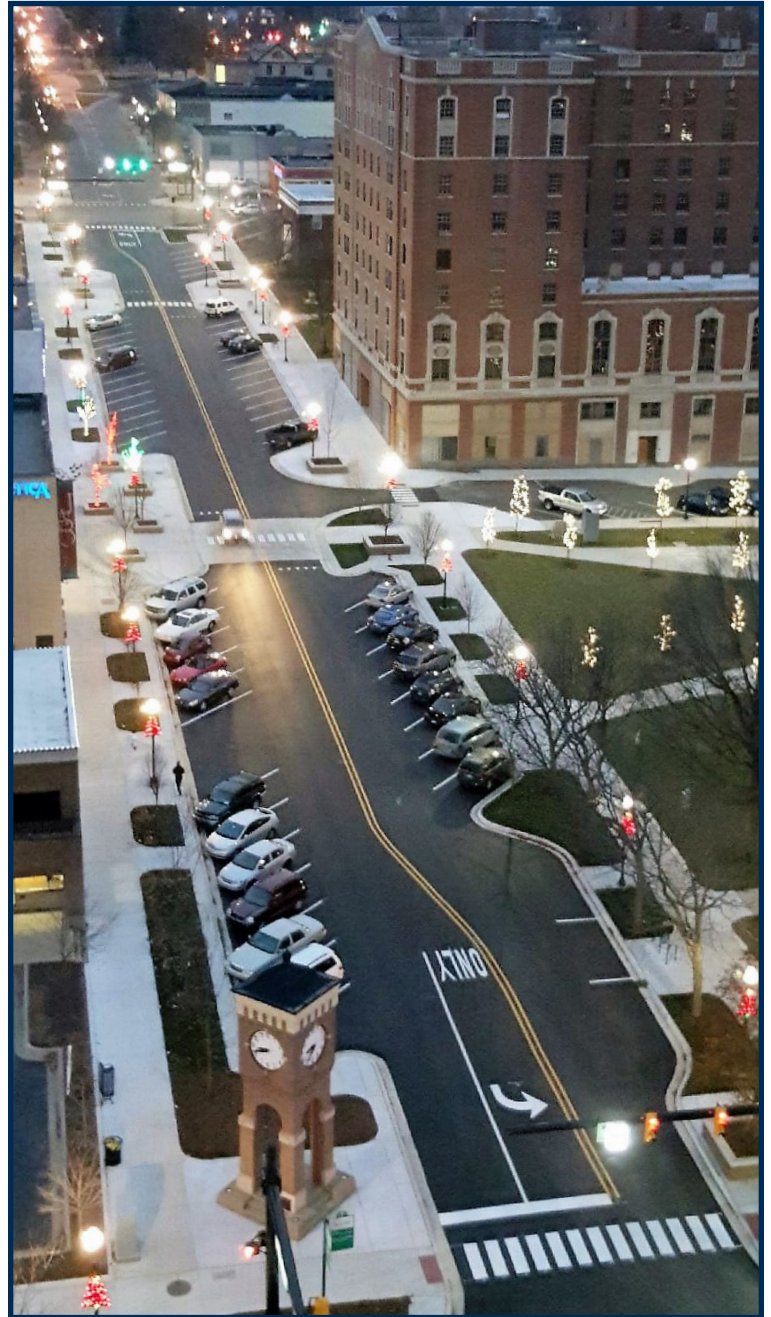
Cars and Christmas lights line the newly constructed Michigan Avenue in downtown Jackson.