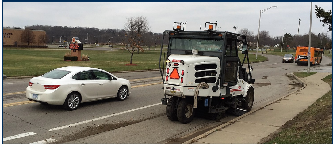
A DPW employee drives one of the city’s street sweepers.

So the next time you’re wondering why DPW employees haven’t fixed this yet, or that over there, remember it’s not for lack of trying - and it’s likely not a slow day at the office.