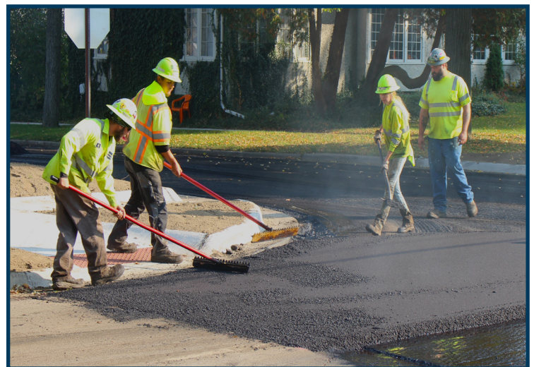
Street construction crews will be a familiar sight this spring.

A full 2024 planned construction project list is avail-