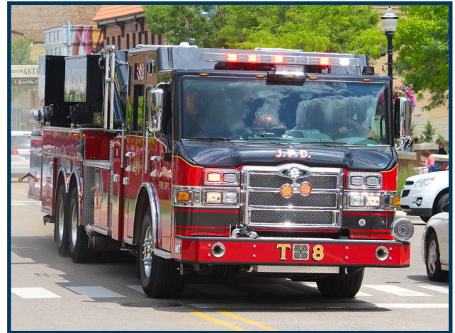
Jackson firefighters respond to an emergency call.