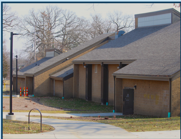
Construction starting at Boos Recreation Center. Renovations will take place through summer 2024.

The center's recreation programs will be shifted to other facilities during the construction.