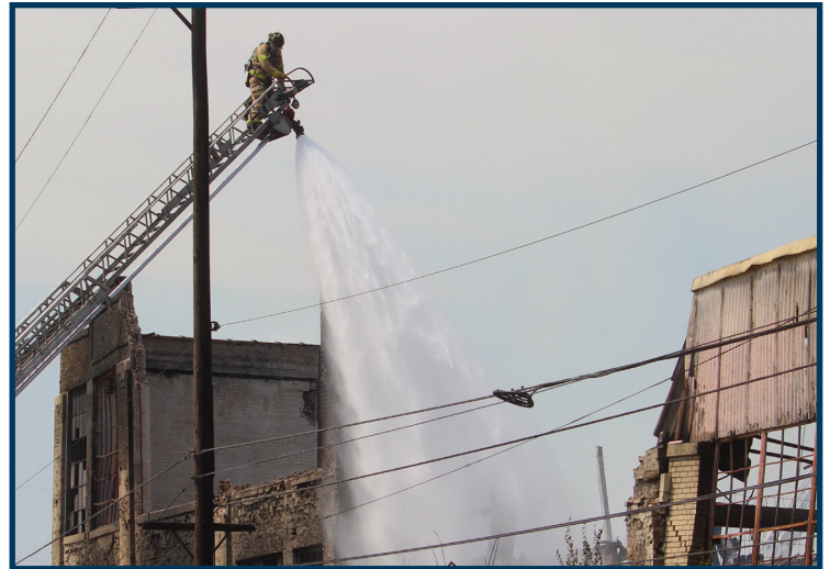
Firefighter responding to W. North Street fire in Aug. 2023.

"Thanks to the intervention of local government, an eyesore and dangerous