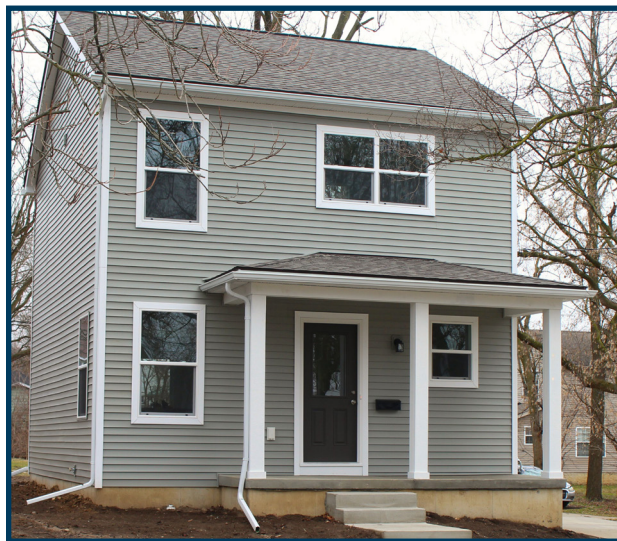
First home completed through 100 Homes Program.

Launched in Oct. 2023 by the Community Development Department, the program is constructing 100 new single-family homes on vacant lots by providing $25,000 in down pay-