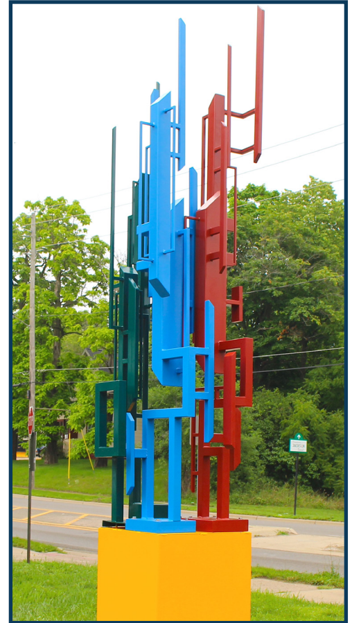
Two new sculptures have been installed along S. MLK Drive.

Sculpture installations at two locations were completed this summer, brightening up the MLK Drive corridor.