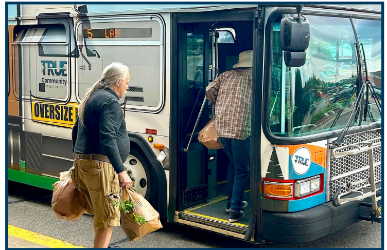
Riders get on a JATA bus after a trip to Kroger on W. Argyle St.

"It's a convenient and dependable door-to-door medical transportation service for non-emergency