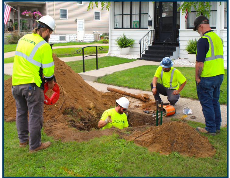
DPW crews replace a lead service line at a home on Bates St.

continue through Nov. and restart in early spring 2024.