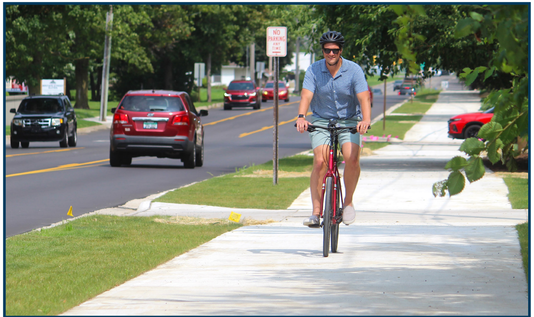
ABOVE: Resident enjoying new pedestrian trail along resurfaced S. Brown Street.

N. Brown Street and S. West Avenue received pavement patching to extend the overall life of the