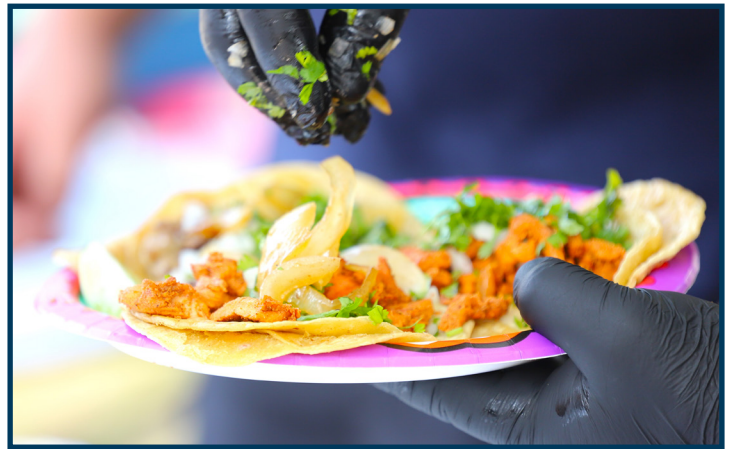
Food traditions are a big part of the festival.