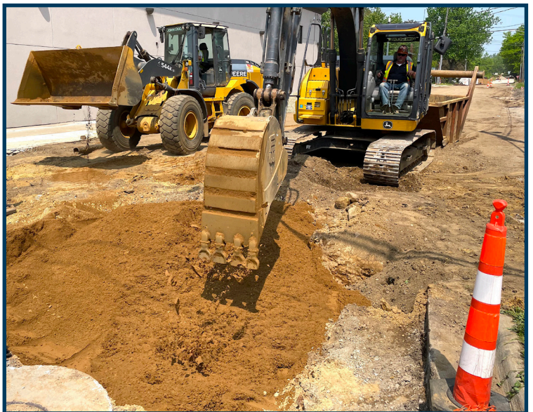
Street construction underway on N. Perrine Street in May.

The Michigan Department of Transportation will also continue railroad overpass construction in Downtown Jackson with completion expected later this fall.