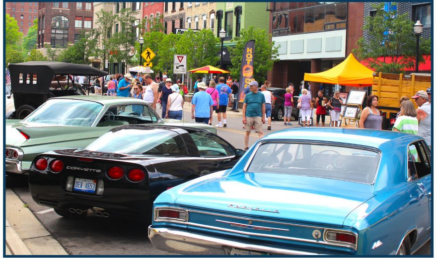
Cruise In classic car show on W. Michigan Avenue.

Downtown Jackson is the place to be if you're looking for summer fun!