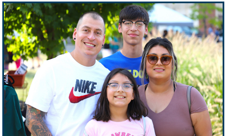
The Gonzalez-Orozco family attends the 2022 festival.