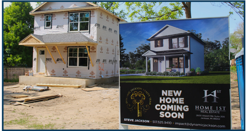
New house under construction on E. Ganson Street.

Powell-Lepard currently resides in a rural area and is excited to live to an established neighborhood that’s close to schools, parks and businesses.